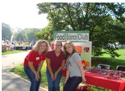
Foodies during the Student Involvement Fair