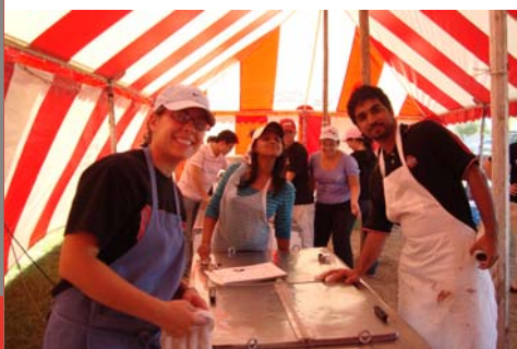
Some foodies during the farm science review ice cream sale.

The Food Science Club once again scooped ice cream at the Farm Science Review, September 16-18. Although the wind gusts caused some pre-review chaos, everything melted smoothly. A few days later, the club entertained a booth at the Annual OSU Involvement Fair spreading our love and excitement for Food Science. The underclassmen were welcomed in a luncheon the day before classes began. In the first meeting, we had a great turn out accompanied by a BBQ. For November, we are planning to have a mitten tree to collect hats, gloves and scarves for the less fortunate. We will also be doing a high ropes obstacle course, a Halloween party and a Thanksgiving lunch. Industry speakers from General Mills, Heinz, and Nestle will be visiting us and holding interviews for internships and job opportunities. The Club is looking forward to a fun and tasty quarter! See you at the next meeting on November 12 th !!