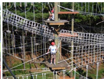
High ropes course, picture taken during last year's trip.